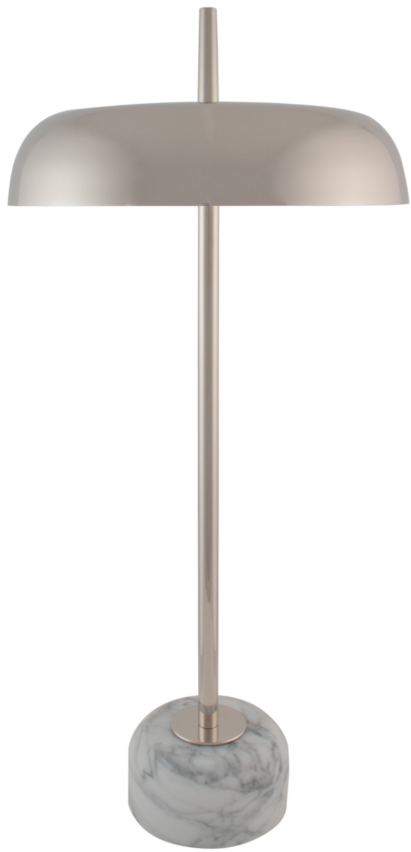
POLISHED NICKEL / WHITE CARRARA