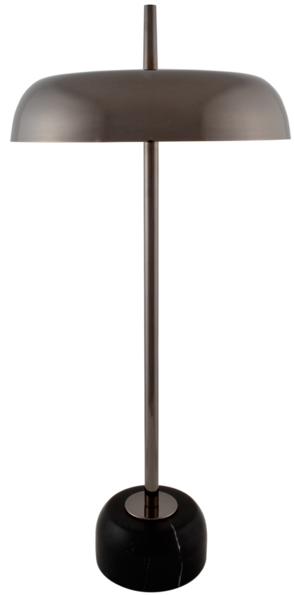
BLACK POLISHED NICKEL / NERO MARQUINA